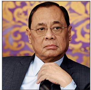
CJI Ranjan Gogoi