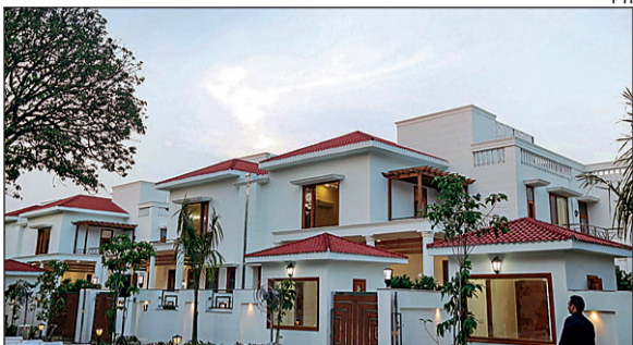
HOUSING LAWMAKERS: PM Narendra Modi inaugurated 36 duplex flats for MPs at North Avenue in New Delhi on Monday